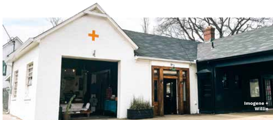
Imogene + Willie